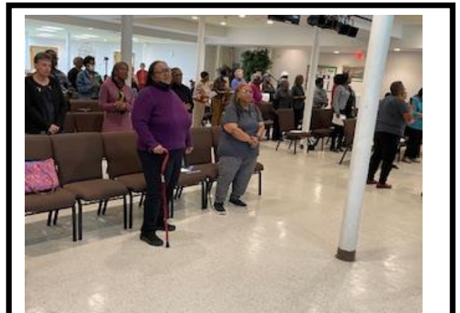
UWF Attendees representing the Peninsula-Delaware Conference UWF during Worship